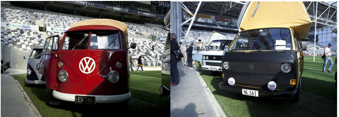
Clockwise from above: