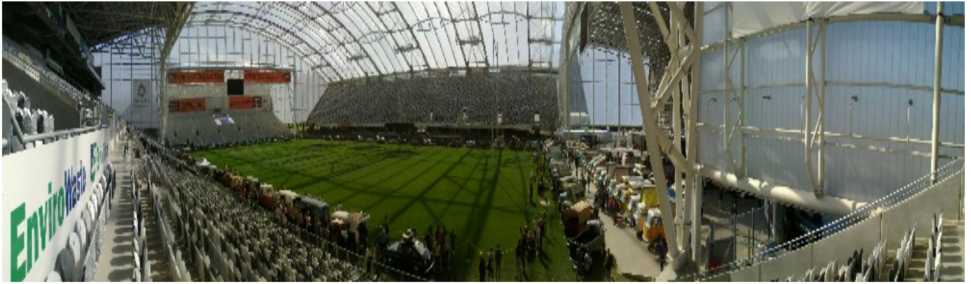
Wide angle view of the covered stadium interior.