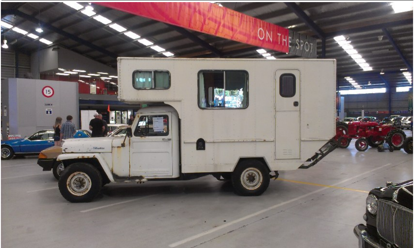
Other vehicles included a Willy's camper with registration on hold, Mk2 Jaguars and 50's Vauxhalls —right through to petrol bowsers and even a few tractors.